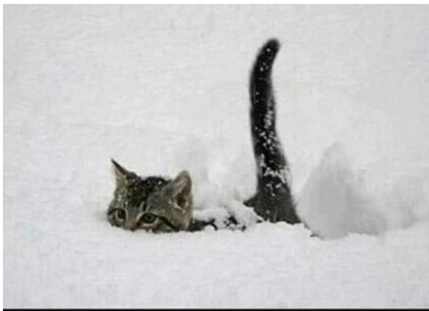
WHEN I FIND THAT GROUND HOG HE'S GONNA DIE!!

*Note: Board meetings are scheduled the same day as regular membership meetings -- they start 30 minutes earlier